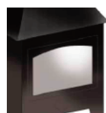
Twin wall insulated flue for log burning stoves