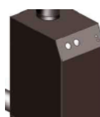
Twin wall insulated flue for pellet stoves and condensing boilers