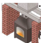
Free standing stove in masonry and timber frame construction