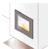
Insert in masonry and timber frame construction