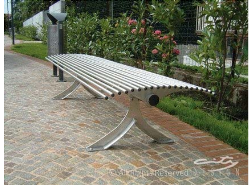
*Photo of painted mild steel version not available at time of publishing